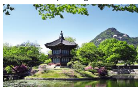
Gyeongbokgung Palace , the largest of the Five Grand Palaces in Korea, is arguably the most beautiful.

Visit UNESCO-designated sites, try on a hanbok in a royal palace, or take a tour of the DMZ! There are an endless number of unique things to see and do in Korea.