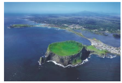
Jeju Island is named one of the New 7 Wonders of Nature. There is so much beauty to see on Jeju that a full year wouldn't be enough.