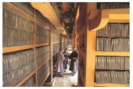
Haeinsa Temple is home to Palmandaejanggyeong (Tripitaka Koreana) and designated as a World Cultural Heritage.